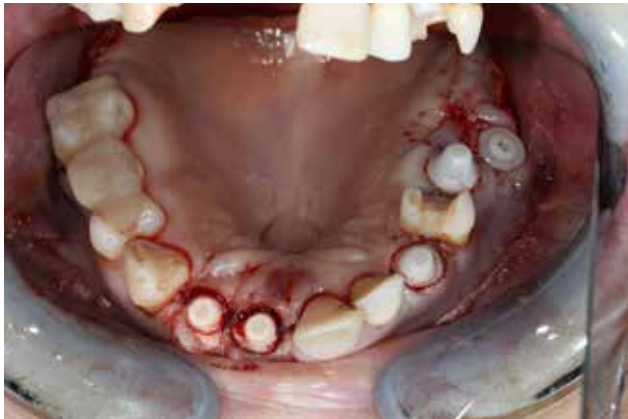
Figure 5: Implant placement of the upper jaw