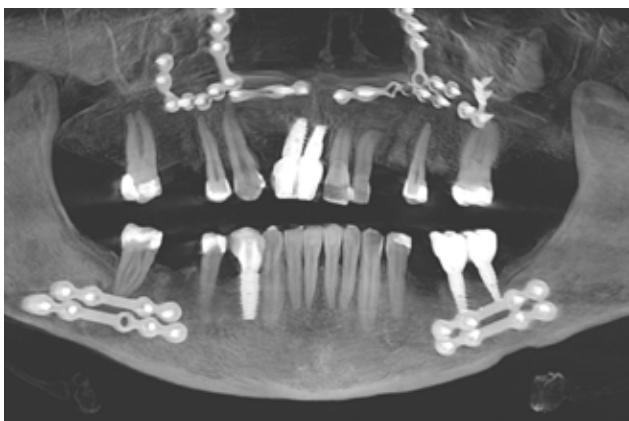
Figure 1: Panoramic x-ray (from 3D scan) 11/2018

Day 1: Under sedation of the patient, oral surgeon Dr. Josephine Tietje removed ten metallic osteosynthesis plates and forty-two screws. The access was chosen to follow the old scars in the vestibulum, partially removing and correcting the course and the thick scar tissue. In order not to restrict the blood supply to the gum tissue, minimally invasive incisions were made. Due to the long period of time that the osteosynthesis plates were in place, bone had already grown over them. (Figure 3). The plates were carefully uncovered using piezo-surgery and fine hand instruments (Figure 4). All wounds were disinfected with ozone,