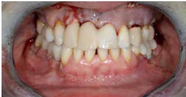
Figure 7: Intraoral situation after placement of all temporaries

Day 2: On the second day of surgery, Dr. Ulrich Volz, specialist and pioneer of ceramic implantology, removed the titanium implants in the upper jaw (region 7 and 8). Since the previous implant positioning was not optimal prosthetically and surgically, bone grafting had to be performed to fill the former drill holes. Bone chips were collected and mixed with the solution of A-PRF in order to generate sticky bone that forms a flexible bone graft. Connective tissue was collected from the maxillary tubal area and placed in the front region to