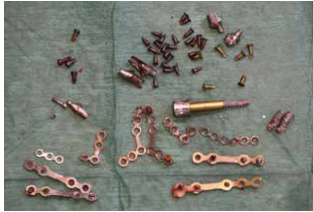
Figure 4: Display of the removed metal