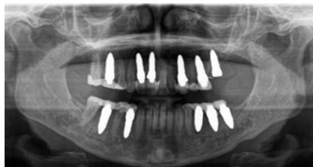
Figure 8: Postoperative panoramic x-ray