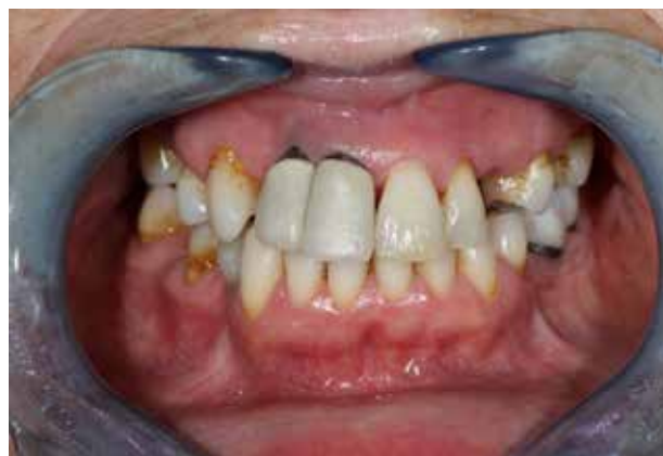
Figure 2: Intraoral situation at time of first introduction to our clinic