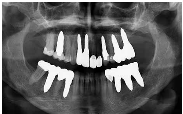
Figure 14: Panoramic x-ray after final prosthetic treatment

restorations with ceramic inlays or onlays and a veneer on tooth 6 in the future. She is very happy and feels much better.