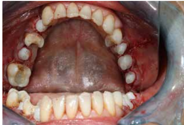
Figure 6: Implant placement of the lower jaw

A-PRF membranes (Mectron Æ , Dr. Joseph Choukroun) were applied to support the healing and the incisions were closed with Atramat (mednaht Æ ) suture material. At this point of time, the sedation was ended and the surgery was continued with the patient awake.